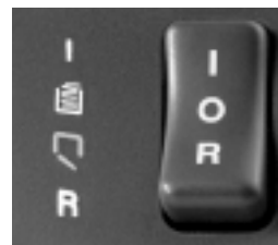
Rocker switch and illuminated symbols simplify operation.